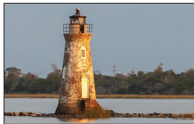
A view of the white painted Cockspur Island Lighthouse from the overlook trail.

There are several spots to access this trail. Designed by the Army Corps of Engineers, the dike system allowed for tide control and drainage that aided in the construction and defense of Fort Pulaski. Today, the dike is twelve feet above sea level and helps protect Fort Pulaski from the tides. This is a great trail for views of the fort and the salt marsh.